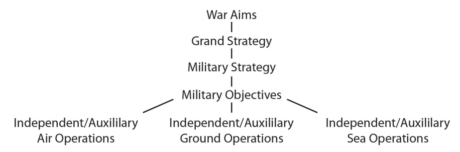
Figure 1. War aims and the application of airpower

by winning. The war aims must be defined, and the application of airpower must be linked to accomplishing those objectives (fig. 1).