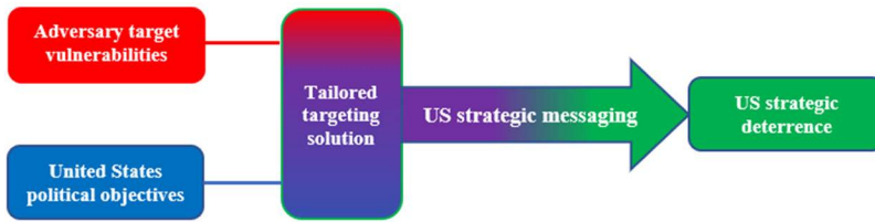
Figure 2. Tailored targeting 37