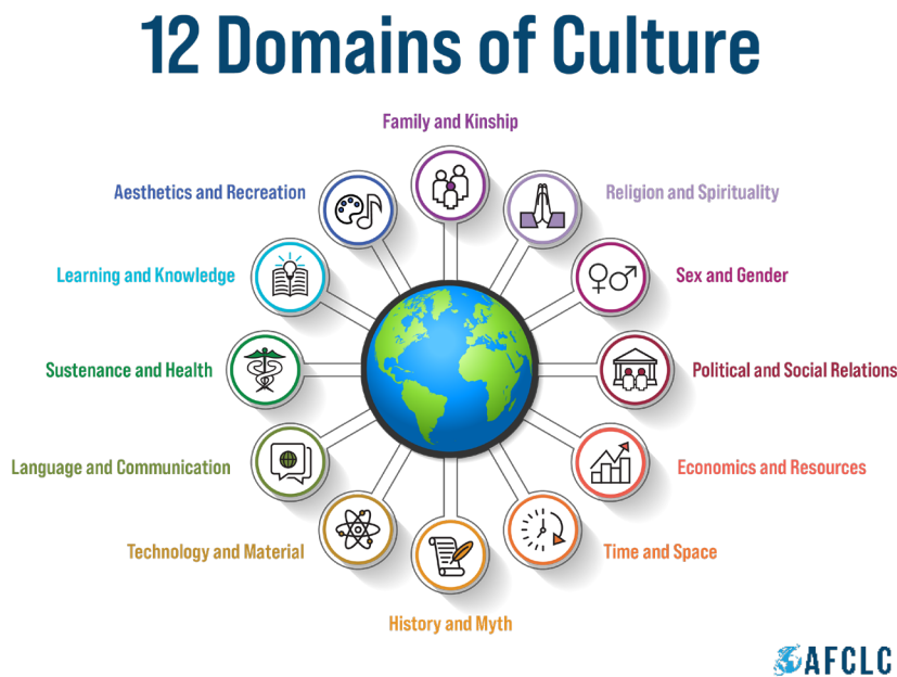
Figure 2 The 12 Domains of Culture

The 12 Domains of Culture - Twelve universal categories of interaction, belief and meaning shared by all cultures but dealt with differently by each culture. These twelve cultural domains are not mutually exclusive. Cultural domains help organize what you see and experience by allowing you to compare general information about culture to your experience, and by enabling you to use that information to understand others’ cultural perspectives.