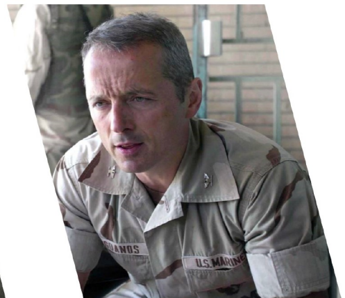
COL MATTHEW BOGDANOS

"CULTURE AND CONFLICT: MODERN COALITION WARFARE"