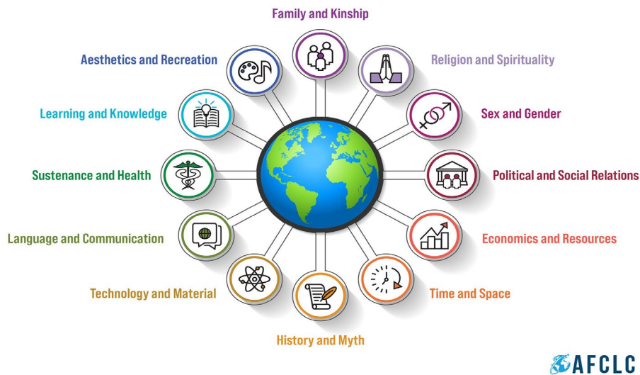
Figure 2 The 12 Domains of Culture