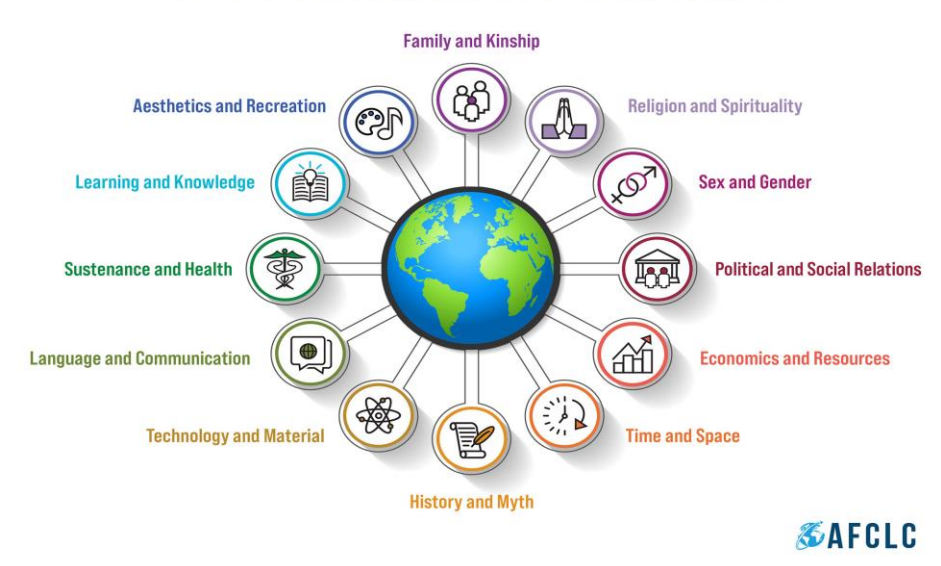
Figure 2 The 12 Domains of Culture