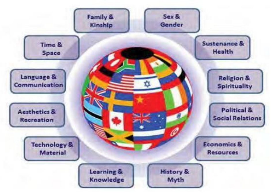
Figure 2 The 12 Domains of Culture

The 12 Domains of Culture - Twelve universal categories of interaction, belief and meaning shared by all cultures but dealt with differently by each culture. These twelve cultural domains are not mutually exclusive. Cultural domains help organize what you see and experience by allowing you to compare general information about culture to your experience, and by enabling you to use that information to understand others' cultural perspectives.