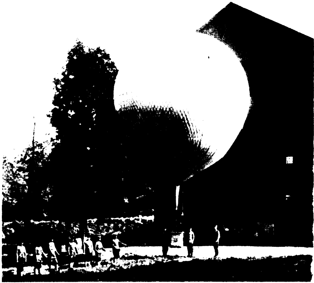
Balloon Hangar, Fort Myer, Va., 1908 -- Barely discernible beneath the tree in the background is the "Gas plant . . . [we used to] make hydrogen gas. We cut up old wood drums . . . [got] iron shavings from the Navy, poured in so much water [and] sulphuric acid and [the] acid eating the iron made hydrogen!"

toes and everything, but you couldn't get no coffee. You had to drink beer! So Barrett and I, we were at Fort Wood there, and they'd give us car tickets to go up to the school, see, and 50 cents to buy our lunch with. We'd go up there, buy a dime glass of beer and get our lunch and have 40 cents left over to go to town on Saturday night. We could have a big time on that."