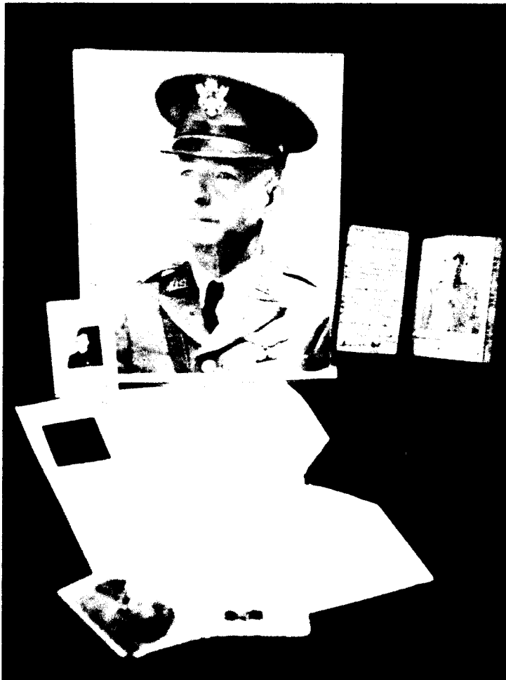
SERGEANTS, July 1989