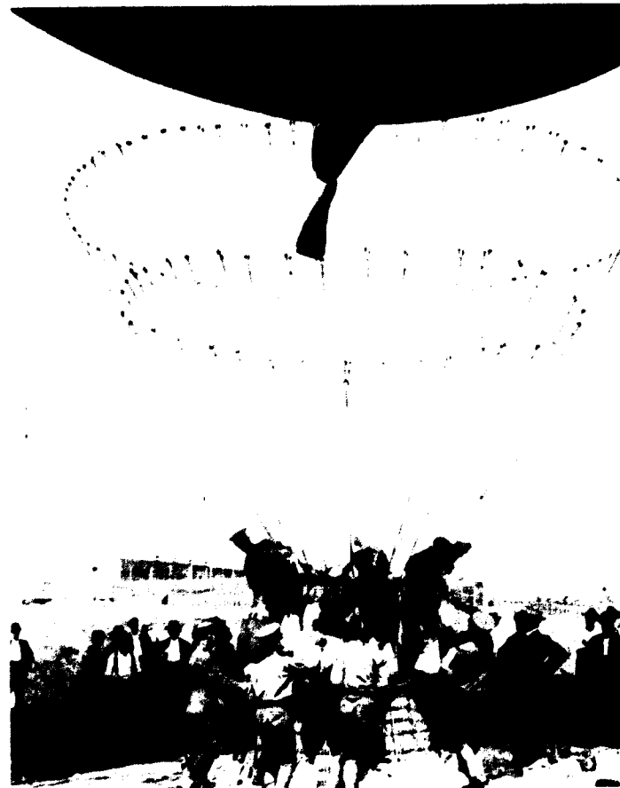
Balloon handlers of the Signal Corps' first aeronautical division prepare their balloon for a launch before interested spectators.