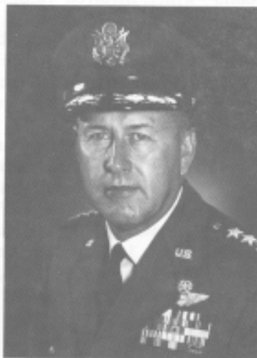
Gen Thomas S. Power

He then administered the Civilian Conservation Corps in New Hampshire. In 1934 he flew the airmail when the task was temporarily assigned to the Air Corps. From 1935 until 1938 Captain Power flew with a bomb squadron in the Philip- pines. In 1940 he completed the Air Corps Tactical School at Maxwell Field.