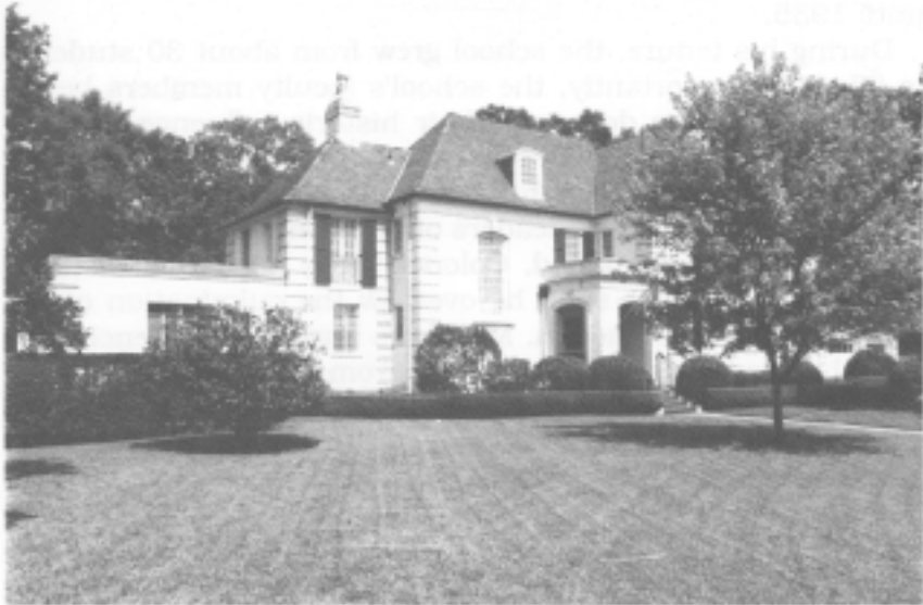
Curry House at Maxwell AFB