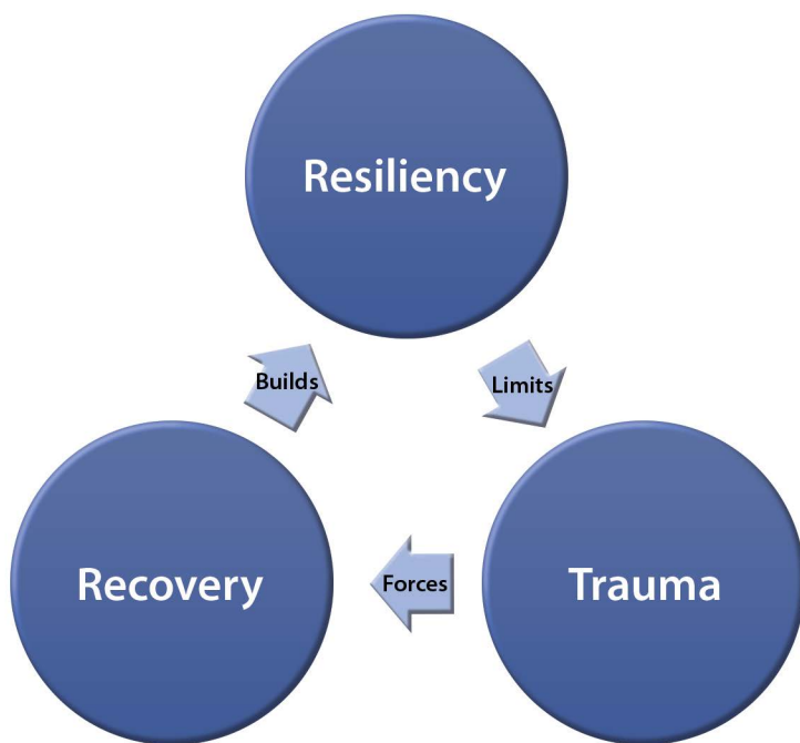
Figure 4.1. Trauma and resiliency model. (Developed by Maj Ian K. VanBergen.)

The Department of the Air Force defines resiliency as the “ability to adapt to changing conditions and prepare for, withstand, and rapidly recover from disruption.” 7 It is one byproduct of overcoming trauma and processing complex, difficult emotions. Hardships and challenges require individuals to adapt to and overcome a difficult or damaging situation, building cognitive pathways and strengthening their resiliency skill sets. These resiliency skills then aid in limiting the severity of future trauma and minimize that trauma’s likelihood of overtaking mental cognition and reasoning. Resilience is a continuous and interconnected process, with each part of the process influencing the other to gain or lose momentum. As recovery and resiliency skills increase, trauma and its effect on decision-making may decrease (see. fig 4.1).