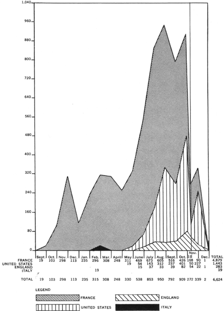
Figure 3. Deliveries of Air Service aircraft by country and month. (Reprinted from Maurer Maurer, The U.S. Air Service in World War I , vol. 1 [Washington, DC: Office of Air Force History, US Air Force, 1978], 66.)