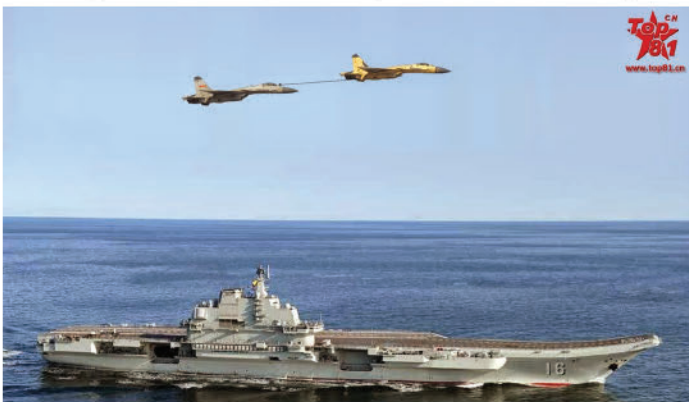
Figure 10: J-15 “Buddy Store” Refueling