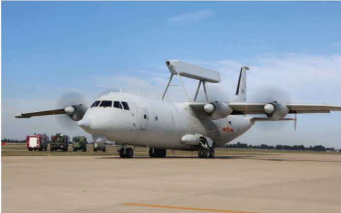
Figure 7: Airborne Early Warning Aircraft Begins Training Event