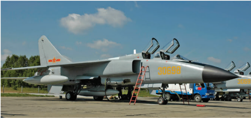
Figure 3: JH-7 Flying Leopard