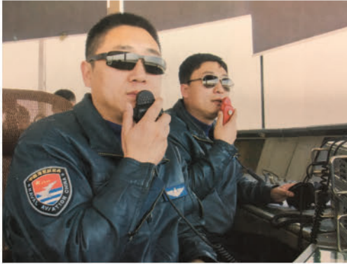
Figure 1: Air Traffic Controllers