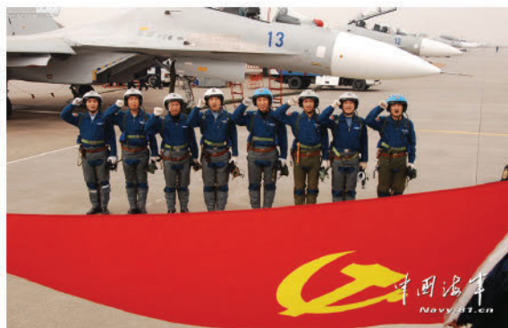
Figure 2: Naval Aviation’s First “Blue Force” Flight Group