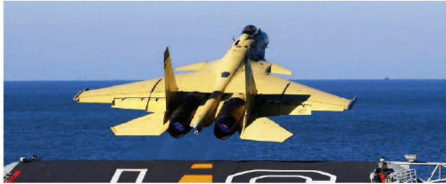
Figure 11: Pre-operational J-15 Takes Off From Land-based Ski Jump Runway During Training

The yellow paint indicates pre-operational status of the aircraft.