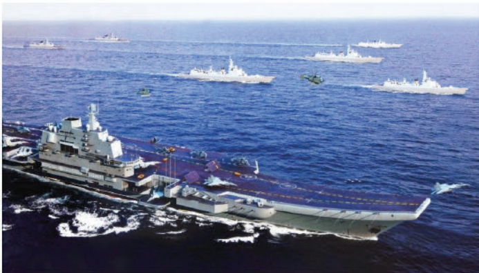
Figure 13: Liaoning Carrier Strike Group Exercise