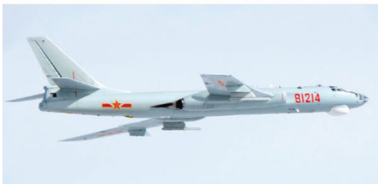
Figure 4: Naval Aviation Bombers