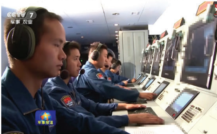
Figure 6: Air Traffic Controllers on Airborne Early Warning Aircraft