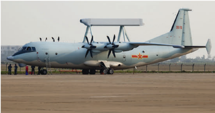
Figure 5: KJ-200, Airborne Early Warning Aircraft