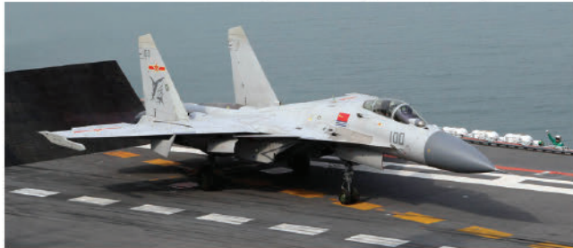
Figure 12: Operational J-15 Takes Off From Liaoning During Training

The grey paint depicts the fact that the aircraft has achieved operational status.