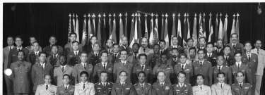
AIFC CLASS 75-0