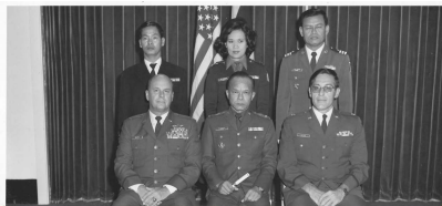
AJFC CLASS 75-D

US / USSR relations were strengthened as Apollo-Soyuz linked up in space.