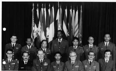
JOPC CLASS 75-A

These International Students walked under Alabama skies in 1975