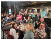
Food, music, good times with friends are always on the menu. There was much rejoicing.