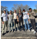
International Military Students of AWC and ACSC and their families enjoy getting together in the River Region