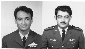
FLORINIS Major Greece

These students of 1975 feature in our International Honor Roll