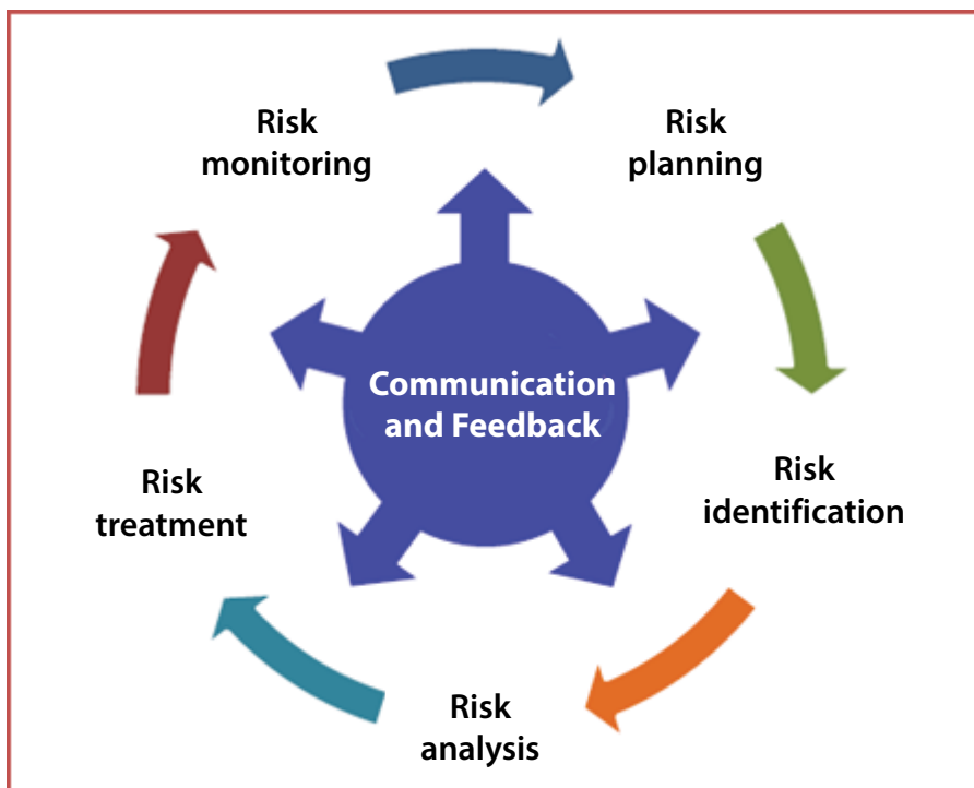
Figure 1. DoD's risk management process

As shown in figure 1, the risk management process, according to the DoD, is similar to those established in international standards.