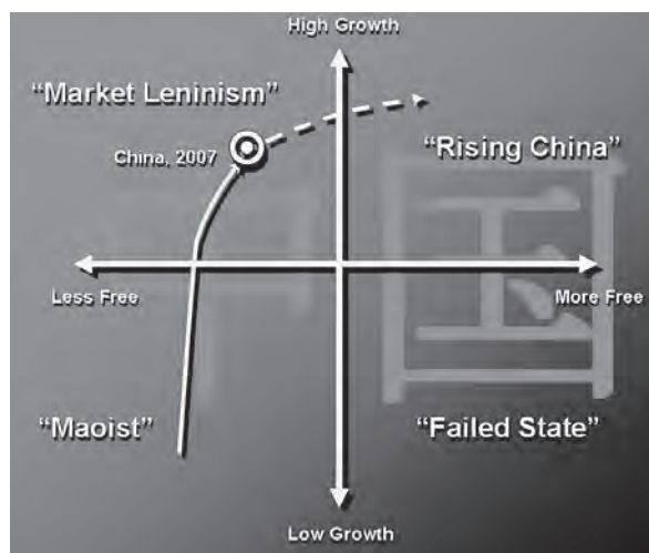
Figure 2. China's trajectory toward free-market democracy

larger than the United States'. 31 Success in this area correlates with Chinese politics and the reform gradient established by Deng and expanded on by Jiang and Hu. Senior director for East Asian Affairs at the National Security Council, Dennis Wilder, plotted the trajectory and China's current position on the curve (fig. 2). 32 Continuing on this trajectory to the “Rising China” quadrant entails meeting challenges that could knock China off this curve and move it in a different direction. 33 Internal discord, natural disasters, world recession/depression, or a crisis in Taiwan are examples of “wildcard” events that could alter the course. Chinese leaders are sure to have prepared contingency plans for the setbacks that can be foreseen, but unforeseen events will test them. Depending on which wildcard or combination thereof, the effect could be as benign as China's 2030 expectations taking many more years or as volatile as internal power disintegration or engagement in global conflict. In any case, to maintain its current Rising China trajectory, Chinese politicians will have to meet all of the challenges, wildcard or not. Moving into the Rising China quadrant by 2030 may yield more growth and freedom in China, but it does