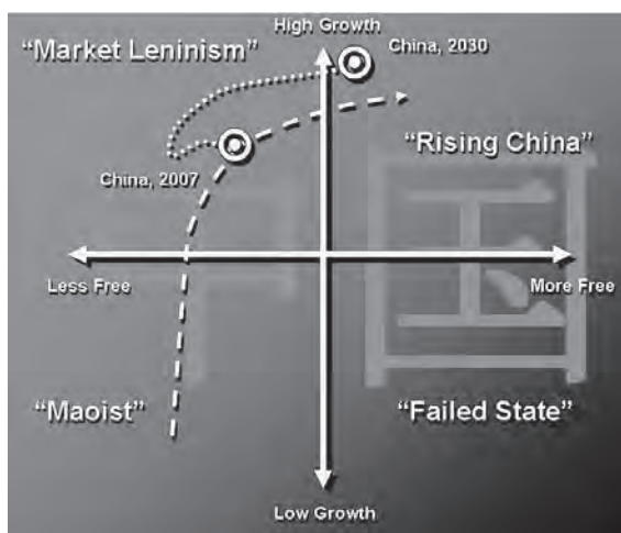
Figure 3: One potential Chinese trajectory toward 2030 -

foreign relations, and its rapid rise through the Deng, Jiang, and Hu eras is essential in designing a vision from which policies can be crafted. China's political power is centralized, but the political elite's activities traverse every element of Chinese society whether diplomatic, informational, military, economic, or cultural. Early Chinese philosophy, still in practice today, espouses indirect action, meeting goals in quiet ways, or creating contradictions to confuse or deceive as methods in achieving objectives. In the political arena, US policy makers should consider the following strategies.